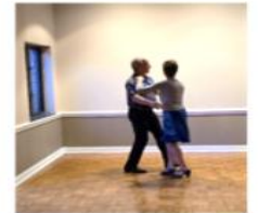
Last year's fun!