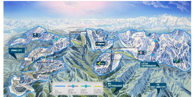
What the Wasatch Mountains ski resorts could look like this if they were linked together.

Would you need a special pass to ski all area? Would more land be purchased. What is the environmental impact? One American model already exists in Utah. Snowbird and Alta already have connecting trails, and the Ikon pass is honored at both resorts. The Alta – Snowbird model may be one to be explored by other resorts to enhance our ski experience. The article goes on to discuss possible links for the Eastern resorts as well. Stuff dreams are made of.