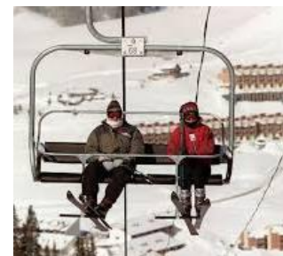
President and Mrs. Carter at Crested

Yes, indeed, President and Mrs. Carter learned to ski in Colorado when they were nearly sixty! According to the CBS article “On President Jimmy Carter's 100th birthday”, his Secret Service detail reflects on the assignment of a lifetime. The Secret Service agent revealed that in addition to the President's fly-fishing passion, the President “in his late 50s — took up skiing, members of the Secret Service were dispatched to a ski school in Colorado.” They all took lessons! To read more about President Carter skiing click here and to learn about their trip to Crested Butte click here .