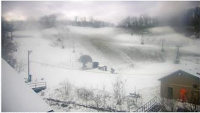
Boston Mills Webcam December 2, at 1:30 p.m.