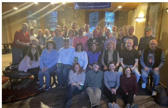
Some of our 130+ members.