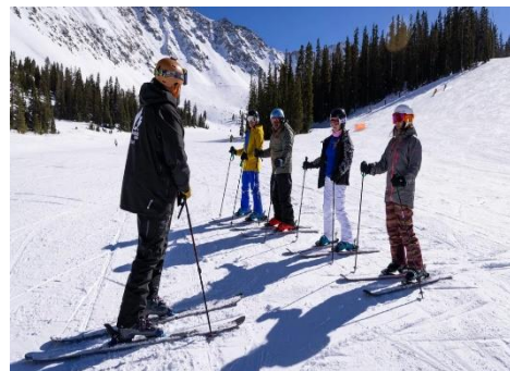
Skiing with friends is fun safe.

What does this mean for us who are beyond 60. The article This Group of Skiers is the Most Likely to Have a Fatal Accident, According to Experts from Ski Magazine does not specifically discuss our age group , but a take away is that we must recognize our abilities when we are on the slopes. We should pay attention to what our bodies are telling us. Take a break and pace ourselves. Above all, don't ski alone and have a safe run!