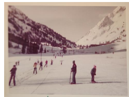
My picture of Alta in 1973. We took a rope tow to get from one lift to another along the bottom.

If you've been to Alta in the early 1970's you know that lift tickets were significantly less than today. A skier found vouchers for two free lift tickets at Alta in an old ski parka. He took a chance and went to the ski area to redeem them. BTW... Lift tickets in 1970 were a. $2.00, b. $7.00, c. $12.00, or d. $15.00. Click here to see how Alta handled the request and learn how much skiing at Alta cost in 1970.